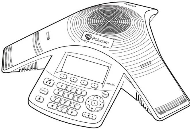
Polycom Soundstation 5000